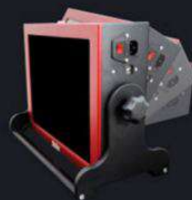
Strong Stand with Turning Knobs

The foundation steadily supports the monitor and easily adjust the viewing angle